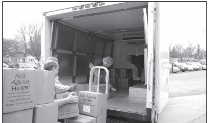
Students from Midland participate in the "Kids Against Hunger" program. "Kids Against Hunger" packages highly nutritious, life-saving meals for malnourished children and their families in developing countries and the United States. The goal of the organization is for its meals to provide a stable nutritional base from which recipient families can move their families from starvation to self-sufficiency. This year the group provided HIDDEN HARVEST with more than two tons of flavored rice products. Great job. Good kids doing good things for community.