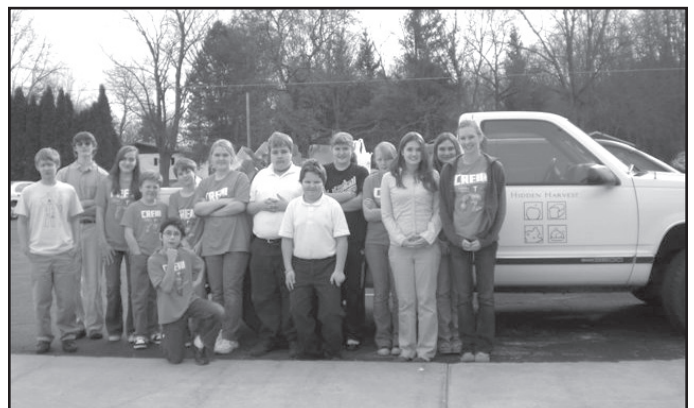
... more Kids from Midland Academy collected a half a ton of assorted food items for area families in need. HIDDEN HARVEST was able to deliver the much needed items to food pantries in the Midland area. A large thanks for a job well done.