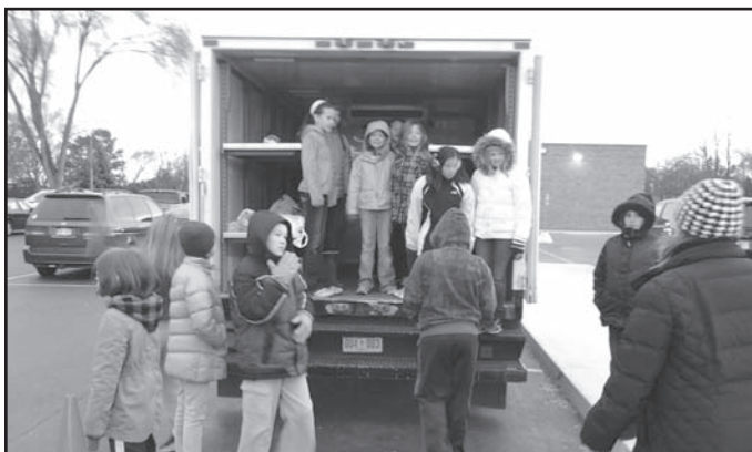
Kids from Hemmeter Elementary in Saginaw collected 97 turkeys for Thanksgiving last year and let HIDDEN HARVEST distribute them to food pantries in our area. Ninety-seven families had a great Thanksgiving feast thanks to "kid kindness".